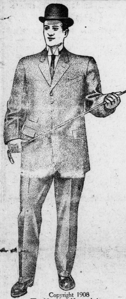
Copyright 1908 The House of Kuppenheimer Chicago

No man can afford to miss this opportunity if he is particular about the style, make and fit. Come early and be convinced before the patterns are picked over.