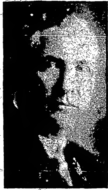
JOHN C. B. EHRINGHAUS GOVERNOR

"Please accept my congratulations upon the announcement of your proposal to issue a weekly paper in Manteo. This is a distinct achievement in the history of Dare County..."