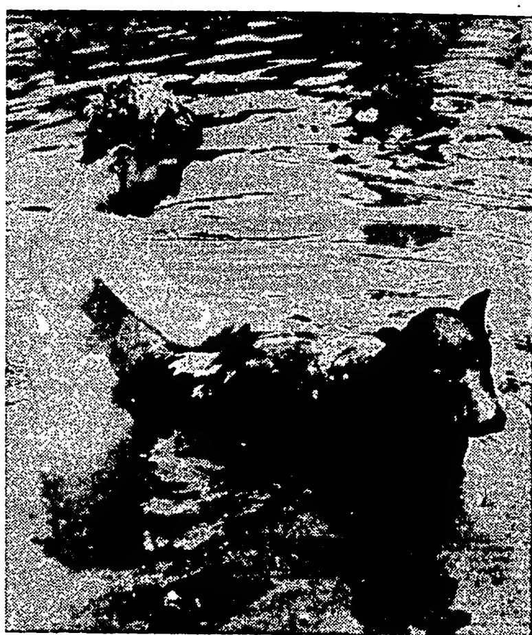
After a long tour of duty on the jungle fighting front, this U. S. Marine and his Devil Dog take a well-earned bath on Bougainville. The dog, a Doberman Pinscher, seems to be wondering what will happen next.