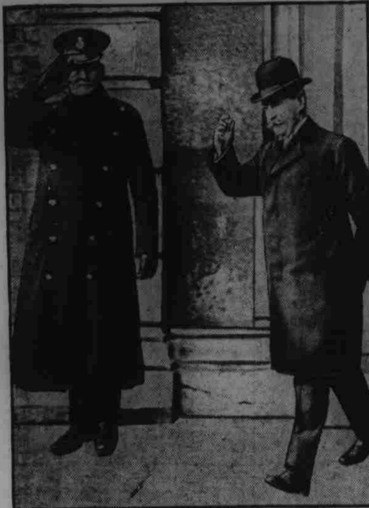
First picture of Lord Fitzalan's last appearance at Dublin Castle. He had turned over the reins of government to Michael Collins just a few minutes before the above policeman rendered his last salute to him.