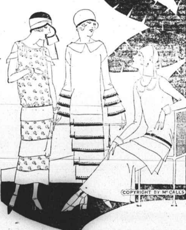
With so much emphasis on the "pencil" silhouette, designers are featuring gowns with flat trimming that does not break the silhouette outline. Instead of being shirred, many flounces are simply straight pieces of material hanging straight against the frock.