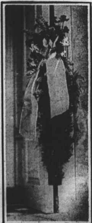
Jonquills and Forsythia were placed on the entrance to the Wilson home late in the afternoon of the day of the former President's death.