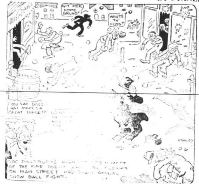
YOU SAY DOES THAT MAKE A GREAT TARGET? WHY THE FUSS? THESE DICKENS-ESQUE MURDERERS ARE HAPPY OF THE FIVE TOLENTS AND THE FLEAS ON MAIN STREET HAD THEIR ANNUAL SNOW BALL FIGHT.