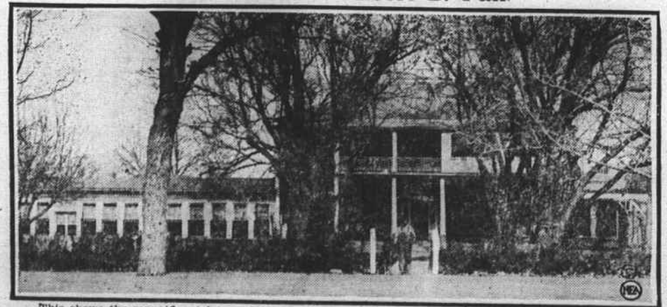
This shows the magnificent home of former Secretary of Interior Albert B. Fall at Three Rivers, N. M. In the foreground may be seen a Mexican farm-hand and a German police dog. The dog belongs to Fall.