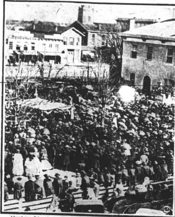
Abraham Lincoln had been assassinated! Citizens of Bloomington, Ill., who had known him when he was a young lawyer and later when he was campaigning for the Senate, gathered in mass meeting to voice their horror over his tragic death. "A Life for a Life," they demanded when John Wilkes Booth's name was mentioned. Similar gatherings were held in every city of any consequence throughout the nation. But as far as can be ascertained, this picture, hanging today in the Bloomington Public Library, is the only photographic evidence that yet remains of any of them.