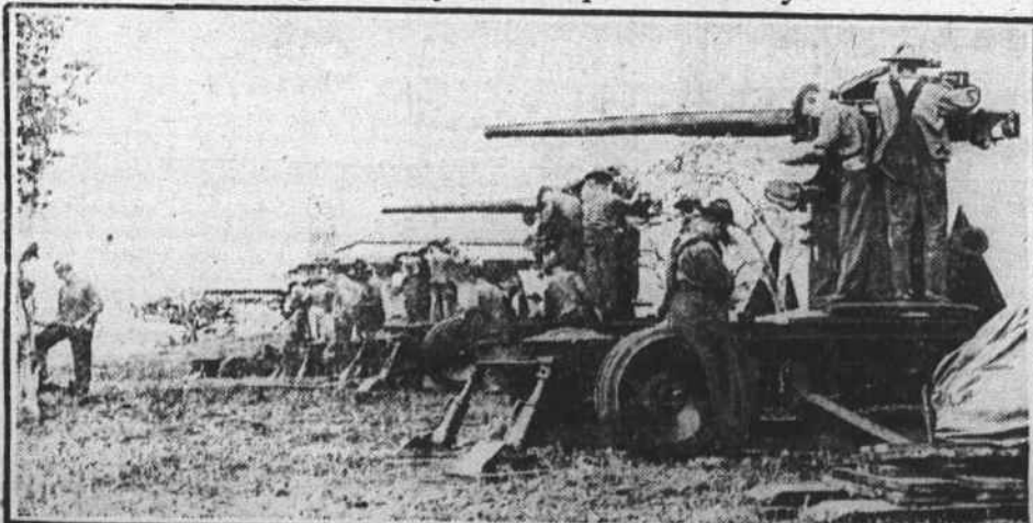
U. S. Marines prepare their anti-aircraft battery for action against the "enemy" in connection with American fleet maneuvers on the island of Culebra in the West Indies. The boys had great sport.