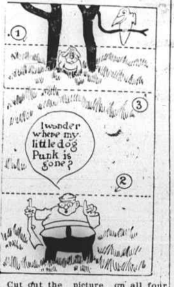
Cut out the picture on all four sides. Then carefully fold dotted line 1 its entire length. Then dotted line 2, and so on. Fold each section underneath. When completed turn over and you'll find a surprising result. Save the pictures.