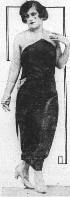
This Paris frock gives a new idea as to how an evening frock may be safely anchored to the wearer—a slender chine about the neck runs through an embroidered eyelet. The swathed, wrapped skirt is another novelty.