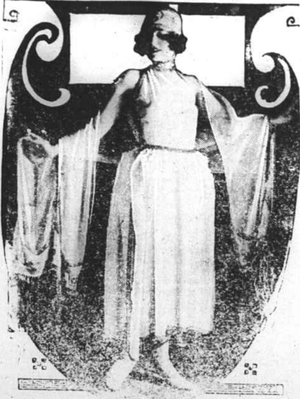
The tightly closed evening frock is one of the little inconsistencies which Paris is fond of. But the real charm of this white satin frock is left to the imagination.