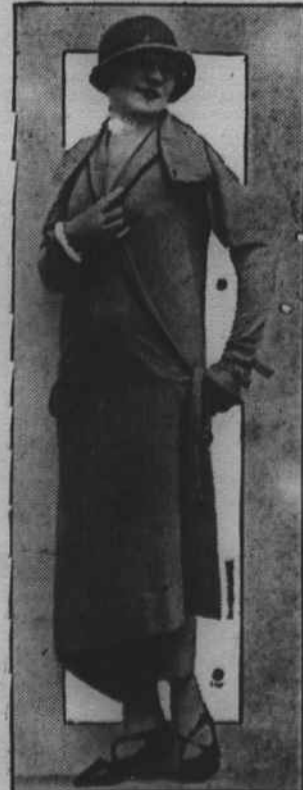
This conservative but smart dress varies a little from the straight up and down policy. The collar is finished with a straight band and the cuffs with circular cuffs. The small pocket offers a parking spot for one of the colorful handkerchiefs that are the mode.