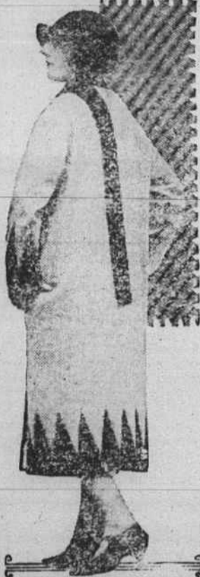
Here is a straightline coat that gains individuality through the use of darker material applied in a pointed design about the hem and cuffs. The scarf collar is more elongated and narrow than many shown.