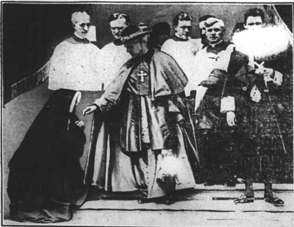
This remarkable photograph was obtained following the celebration of his first mass by Cardinal Hayes. It shows a nun, on bended knees, who was the first to kiss the cardinal's new ring and was taken at the Church of Santa Sussana, American church in Rome.