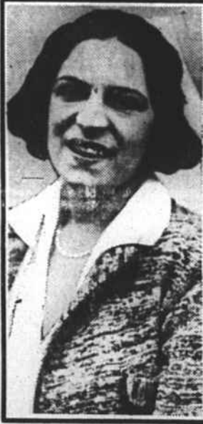
Shades of ancient Greece! The Olympic games, where the male of the species put his strength to test in ancient days, threatens to be "hogged" in these days of feminism by the fair sex.