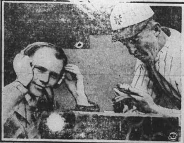
If the "sick grandmother" gag won't work, the small boy can still attend the baseball game, thanks to the present high perfection of the radio.