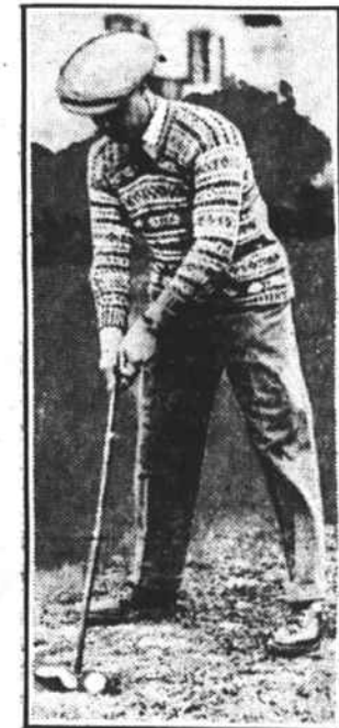
If His Highness was wearing threw him—well, everything is ex-plained. Ten, it's the Prince of Wales and his very colorful golf sweater threatens to become fash-