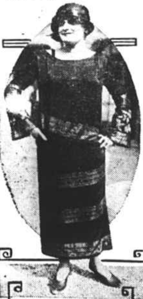
This frock has the advantage of being ready to wear without adjusting any white collars or fancy vests. Its plainness, however, is relieved by the pointed, pleated overturn. In crepe de chine or any light silk material it makes a costume easy to make and easy to wear.