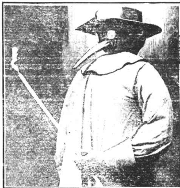
No, this isn't the latest photo of a gentleman from Mars. It's our old friend, the family physician. But how he has changed! The garb he is wearing is the type used during the London plague, and other outbreaks of contagious disease.

for their beans last fall and this in face of a demand so great that there should be a more stable market for beans at all times. The agents also reported that these same soy beans are now selling at from $2.50 to $3.00 per bushel and that many farmers who had beans last fall are now unable to supply the demands being made on them for seed.