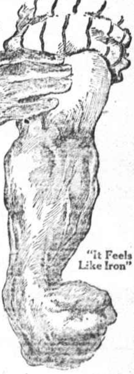
"It Feels Like Iron"

NUXATED IRON ENRICHES THE BLOOD - GIVES YOU NEW STRENGTH AND ENERGY