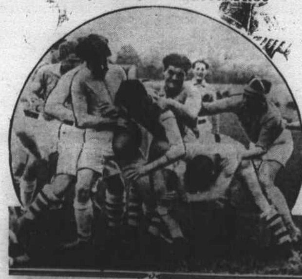
The American Olympic rusby foliabili team, whose winning of the Olympic contest in Colembes Bladdim, Paris, all but started a rio Hissed and bosed by the Paris crypts the Tankee boys played a gree mane. First lights took place in the stand when Americans chosend the team.