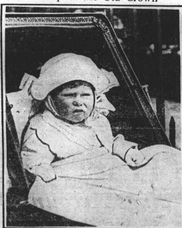
Latest and exclusive photograph of Master Lascelles, son of Princess Mary of England and Lord Lascelles, and grandson of King George. Note the resemblance to members of England's ruling family.