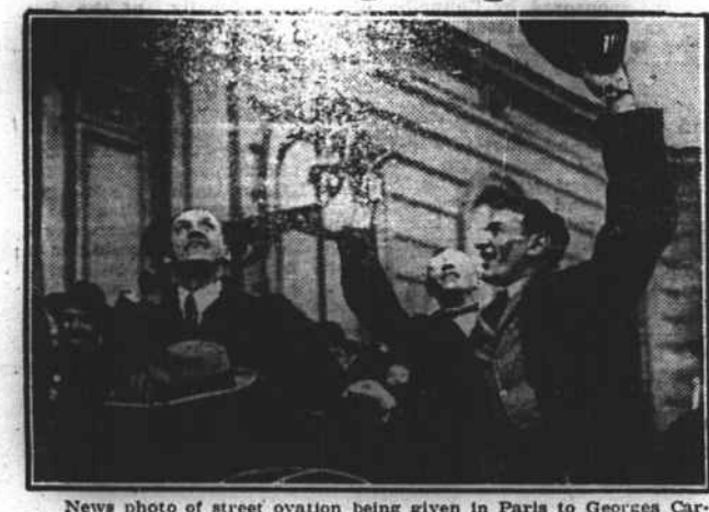
News photo of street evation being given in Paris to Georges Carpentier a few days before he sailed for the United States for his bout with Tommy Gibbons.