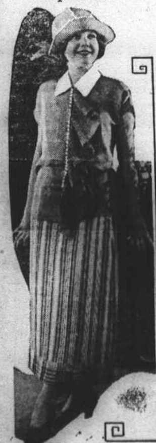
The popular separate blouse and separate skirt for summer are here shown making the perfect ensemble. The overblouse is of white creps de chine heavily overdotted with tiny black dots, with a white collar and a pleated jabot. The skirt is of red and white stripes, pleated. The blouse would be equally smart with a suit skirt or with