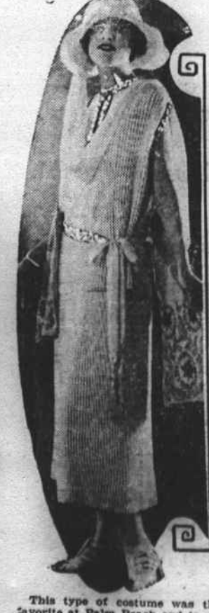
This type of costume was the avorite at Palm Beach and is expected to be at all the summer resorts this season—just a simple pleated outfit of white canton crepe embroidered at the beelt, sleaves and neckline. It is the simplest of all frocks to make at home because the pleater does the work. It is lovely in delicate colors or even in black.