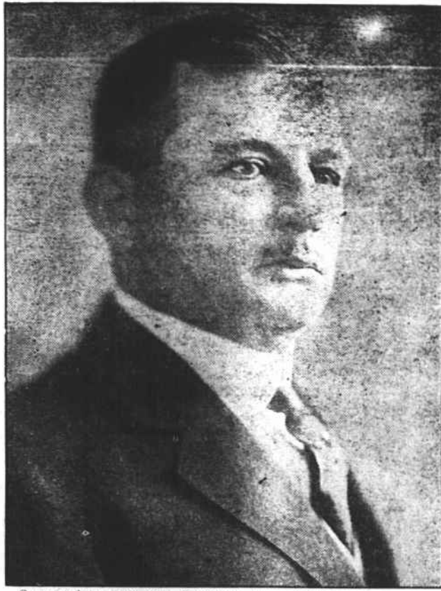
Congratulate your next Governor, Angus Wilton McLean of Lumberton, who has overwhelmingly defeated Josiah William Bailey of Raleigh for the nomination for Governor and will oppose I. M. Meekins of Elizabeth City, Republican, in the November elections.