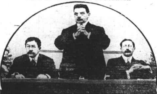
Latest photo of M. Herriott, "man of the hour" in France, shown in speaking attitude. At left is M. Painleve and, right, M. Henri Blum, both of whom will be in the new Socialist cabinet.