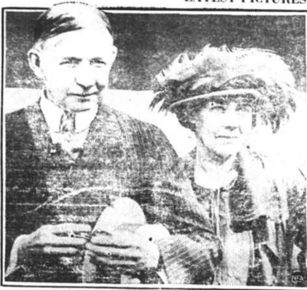
General Charles G. Dawes and Mrs. Dawes snapped at Marietta, O., shortly after the nomination.