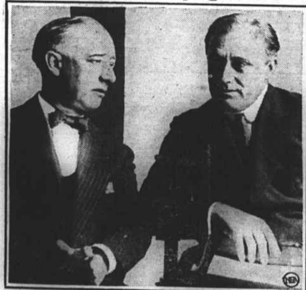
Governor "Al" Smith and his campaign manager, Franklin D. Roosevelt, shown discussing the Smith boom on the eve of the Democratic Convention opening.