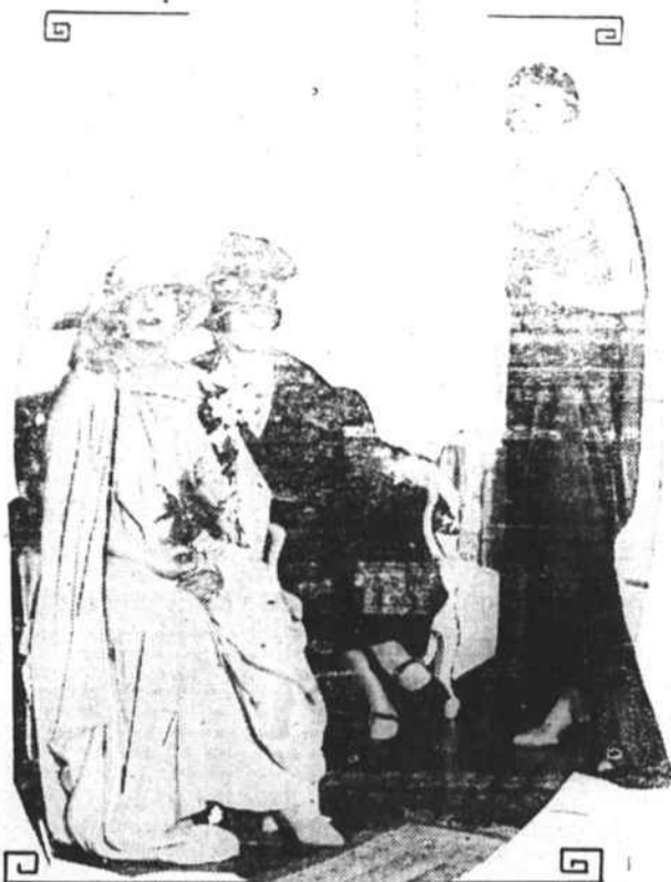
Fit for a queen? A perfect fit! Queen Marie of Rumania demands it. This unusual photograph shows the royal lady deciding upon her wardrobe—probably one of the most informal pictures to be taken of a member of Europe's royalty.