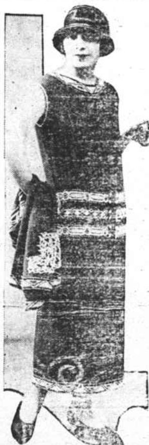
Here's the three-piece suit for summer, as Paris sees it. A sleeveless frock of black crepe de chine with trimmings of white embroidery, and a short, straight coat similarly adorned. It is particularly recommended for street wear.

Paris, June 28.—Tiny pleatings arranged in bands and in V shaped panels form the decoration on various new frocks. They were gener-