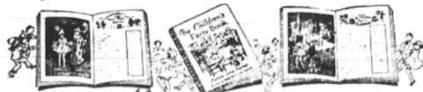
40 Pages--10 Full-Page Color Illustrations--Parties--Games--Recipes, etc.