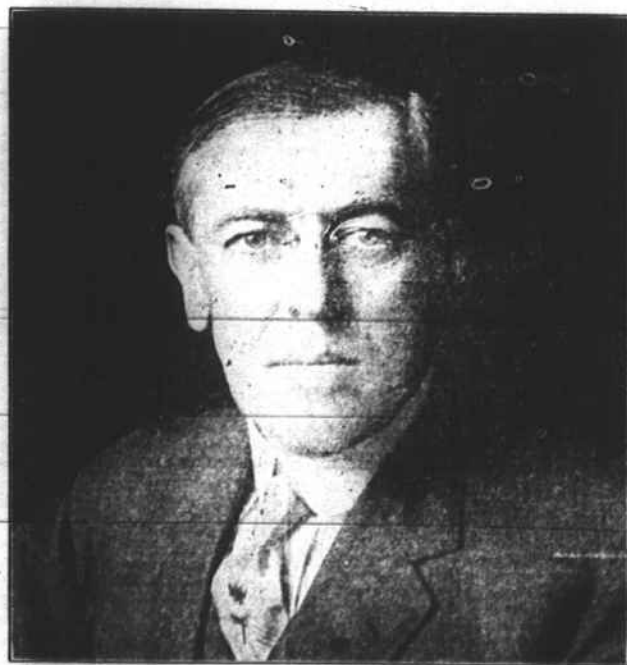
To his comrades, the officers, crew, and marines of the U. S. S. George Washington, with the warmest good wishes of Woodrow Wilson

FROM THE LIFE OF WOODROW WILSON. © THE J. C. W. CO., 1914.