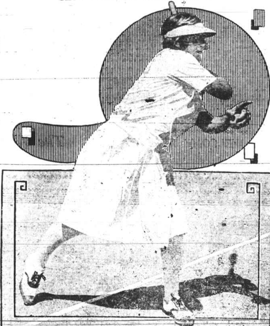
"Lady-in-waiting to Queen Helen Wills" is the title which California has bestowed upon Helen Jacobs, 15-year-old girl tennis star of Berkeley, Calif. Experts agree that Miss Jacobs is potentially another Helen Wills.