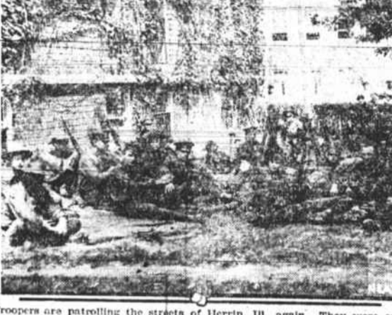
Troopers are patrolling the streets of Herrin, Ill., again. They were ordered in by Adjutant General Carlos Black following rioting between Sheriff Galligan's forces and known members of the Ku Klux Klan...