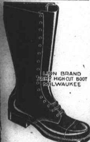
LEON BRAND VERY HIGH CUT BOOT MILWAUKEE