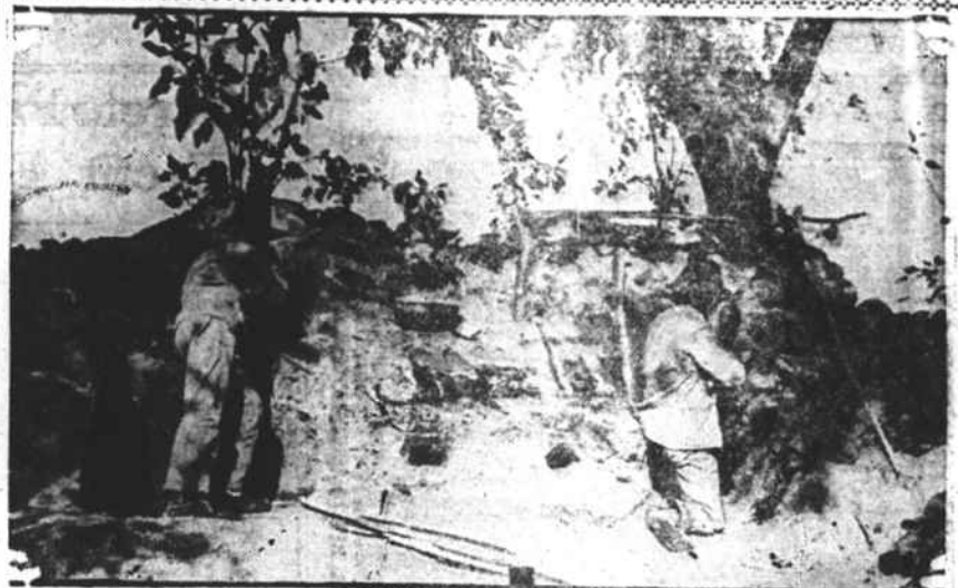
ABOVE—A LIQUOR SMUGGLERS' OUTPOST ALONG THE RIO GRANDE NEAR EL PASO. THE MEN WERE ENGAGED IN TARGET PRACTICE WHEN THE CAMERAMAN HAPPENED TO BE ALONG. BELOW—OFFICIALS FLOODING STREETS OF EL PASO WITH HUNDREDS OF BARRELS OF CONFISCATED TEQUILLA, A MEXICAN WINE.