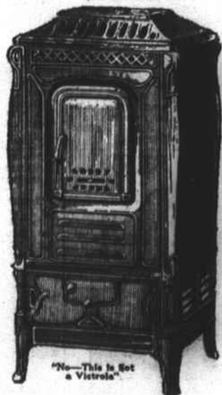
"No—This is Not a Victrola"

CIRCULATING MOIST HEAT—MOST HEALTHFUL HEAT KNOWN