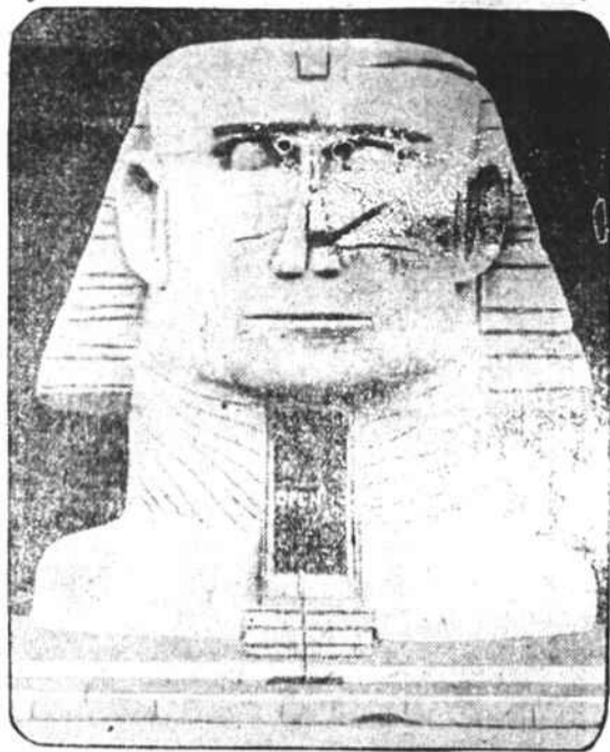
Hollywood, home of movies, is a topsy-turvy town—so much so that even the business houses are affected. This shows a real estate office built like an Egyptian sphinx.

From Northwestern United States to New Zealand is a long long mile, but here a totem pole in New Zealand and that's a Maori chieftain who seems to be the keeper of the totem. The figure in the original "big stick" of the Maori and the photo shows the figure in the totem pole is holding one. If Speaker Longworth could get one like that the insurgents would pipe down—maybe.