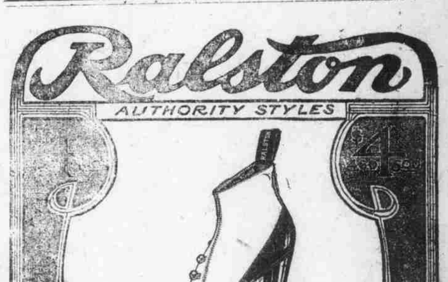
CAHOON 8 CYDE