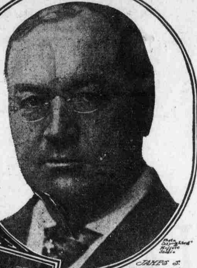
JAMES S. SHERMAN PRESIDENT OF THE SENATE

Who is going to succeed Nelson W. Aldrich as chairman of the most powerful committee in the senate of the United States? Nobody knows. Senator Julius C. Burrows of Michigan ranks next to Mr. Aldrich on the finance committee and in the natural order of things he would succeed