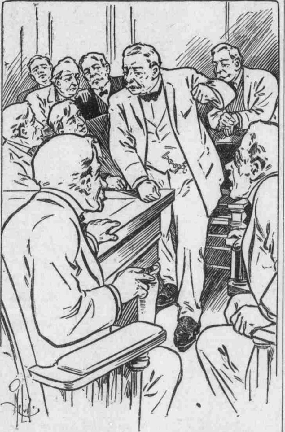
"He's an Adulterer, a Thief, and a Self-Confessed Murderer!"

A shelf of this kind will prove the greatest boon to an invalid, as on it may be kept well within reach all those little things in the shape of books, papers, watch, glass, etc., that are always so necessary for the invalid to have handy, and who may thus obtain them with the least possible exertion.