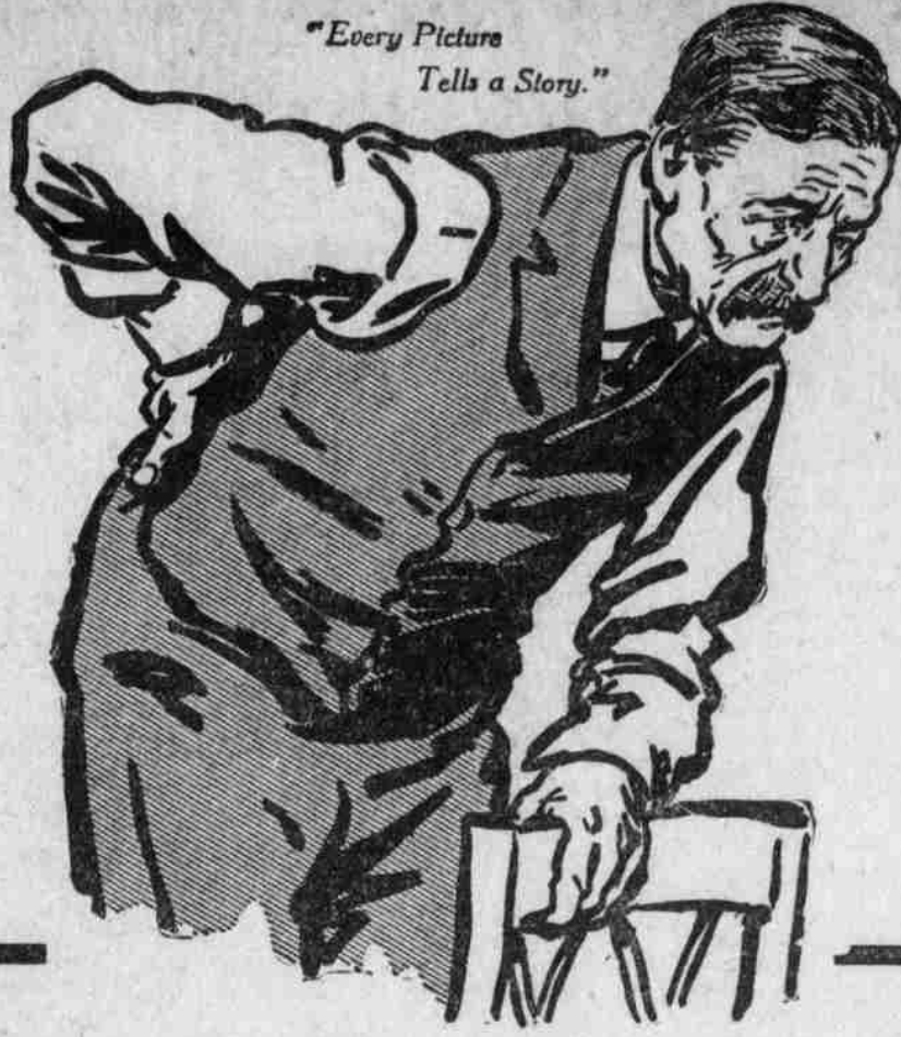
"Every Picture Tells a Story."

The day had opened cloudy, chilly and dismal, but as the president stepped forward to take the oath from the aged Chief Justice Taney the sun burst through the clouds and shone full on the bowed head of the man who was to give up his life for the country he loved. Lincoln himself noticed this "sunburst" and drew from it a happy augury.