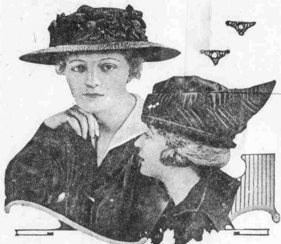
Elegant Hats for Those in Mourning.

It will be noticed that the skirt extends only a little below the shoe tops and it is not likely that the sports skirt will lose character by growing longer. One may wear a suit of this kind with assurance. It is good to look at and full of its own style. Although the color combination is as quiet as possible the fabrics and the cut of the garment give the suit plenty of "snap." There is nothing tame or commonplace about it.