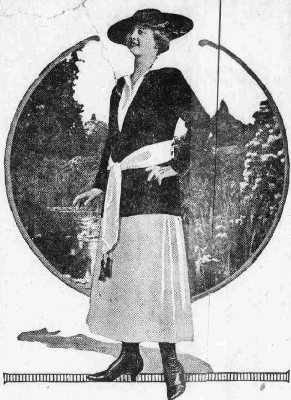
New Sports Suits for Autumn.

Before the summer sports or pastime suits have vanished from our midst their successor has entered and made its bow. It is destined to bloom with the goldenrod and asters and it is naturally of heavier materials than the suits for summer weather. Serge, velveteen, and corduroy contribute to its durability and to its style as well. It is likely that these new sports suits for autumn will be innocent of stripes. Those shown so far are of plain materials or of plaids and plain fabrics made up together, and they are undeniably smart. Young or old, women wear about the same styles in them, and they subtract years from the matron's appearance in a way to make her rise up and call them blessed, besides cheerfully parting with her good money for them. Among the most enticing suits, those made of white serge combined with the same materials in handsome colored plaids are triumphing. Some-