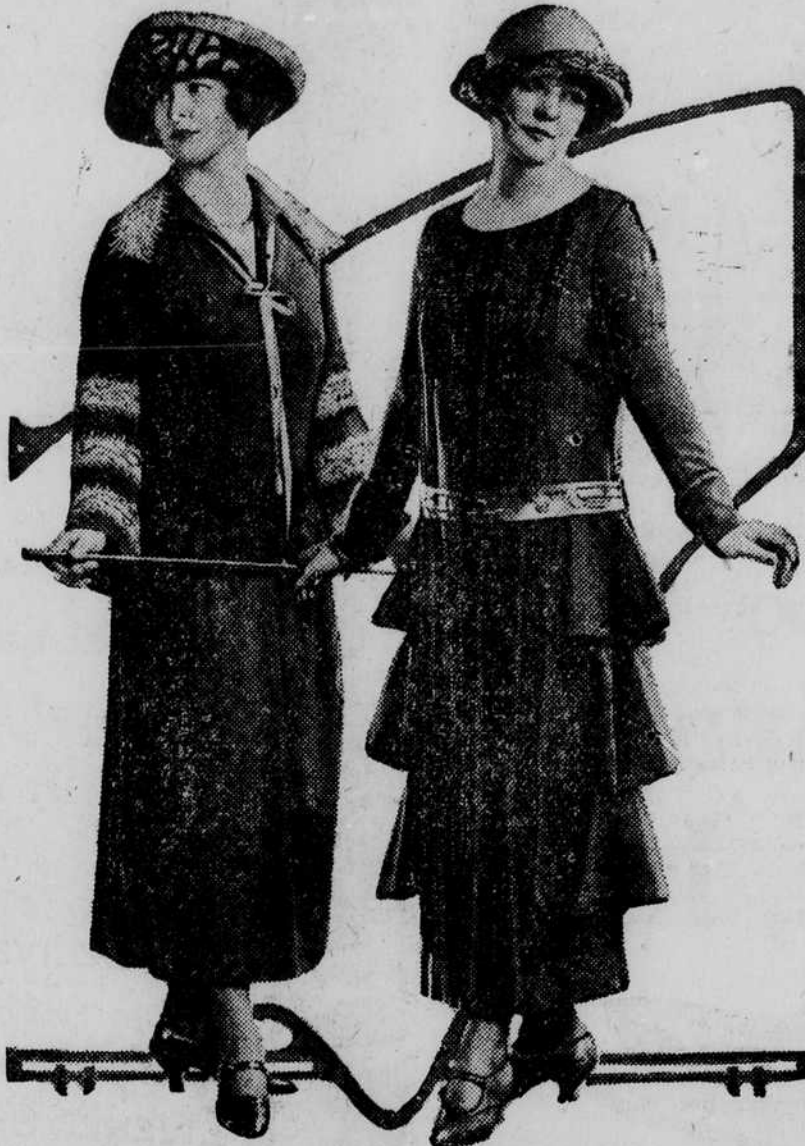
Two of the Latest Street Dresses

in fancy-work departments are enough to stir deft fingers into action. To resist the temptation of such glorious colors and varied yarns is not in the power of womankind. Then, too, what a thrill of satisfaction goes with the proudly spoken words, "I made it myself." Extreme individuality is difficult to achieve these days and one values the style distinction of the hand-made sweater. Surely it is well worth while to devote time and effort to the creating of a