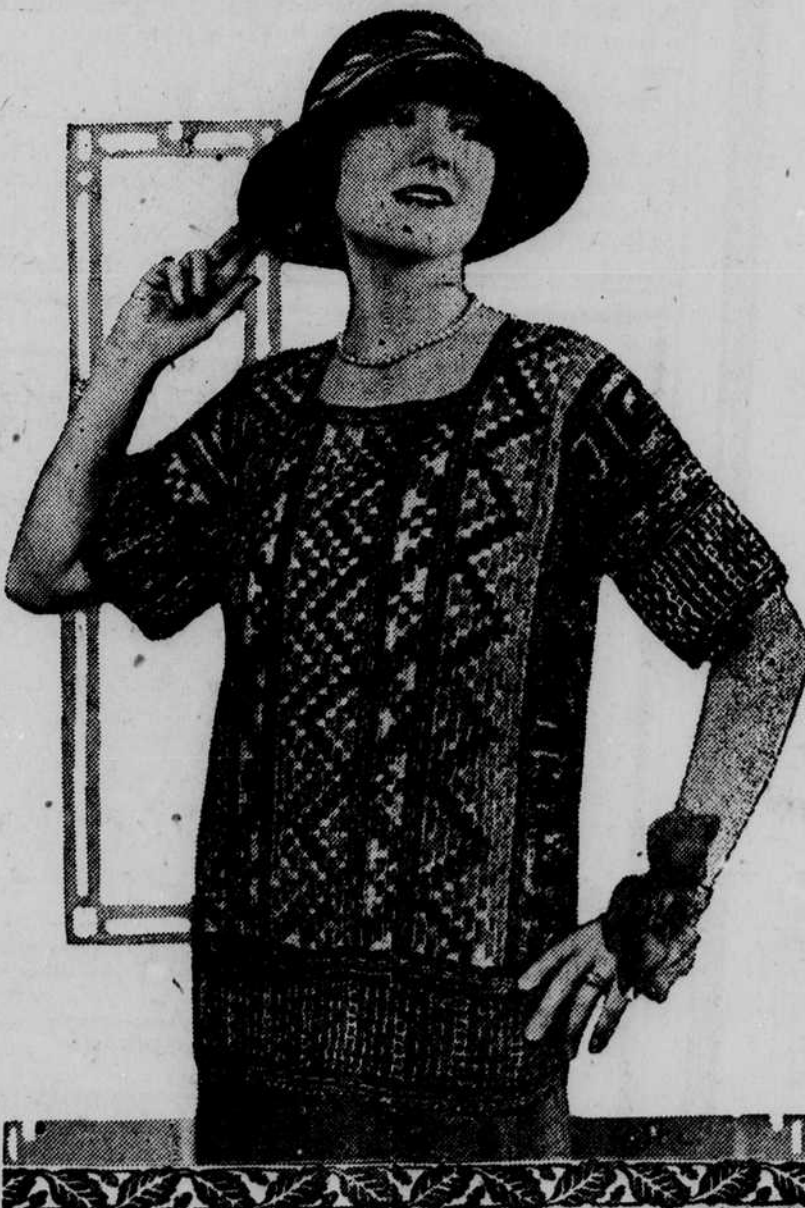
Pretty Hand-Made Sweater

Do Not Disput. Many happy families are kept happy by not disputing, but simply doing as one likes.