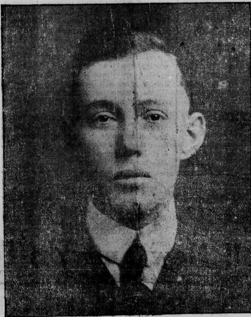
POPULAR CONDUCTOR OF PRAYER SERVICES

Elected by largest County Majority To Serve as Sheriff For Next Two Years.