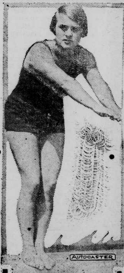
Aileen Riggis is again demonstrating that she is queen of the waves in fancy diving and will easily retain her national title during 1925. This excellent photograph is the newest of her.

LEY'S HONEY AND TAR for children; safe, sure. No opiate