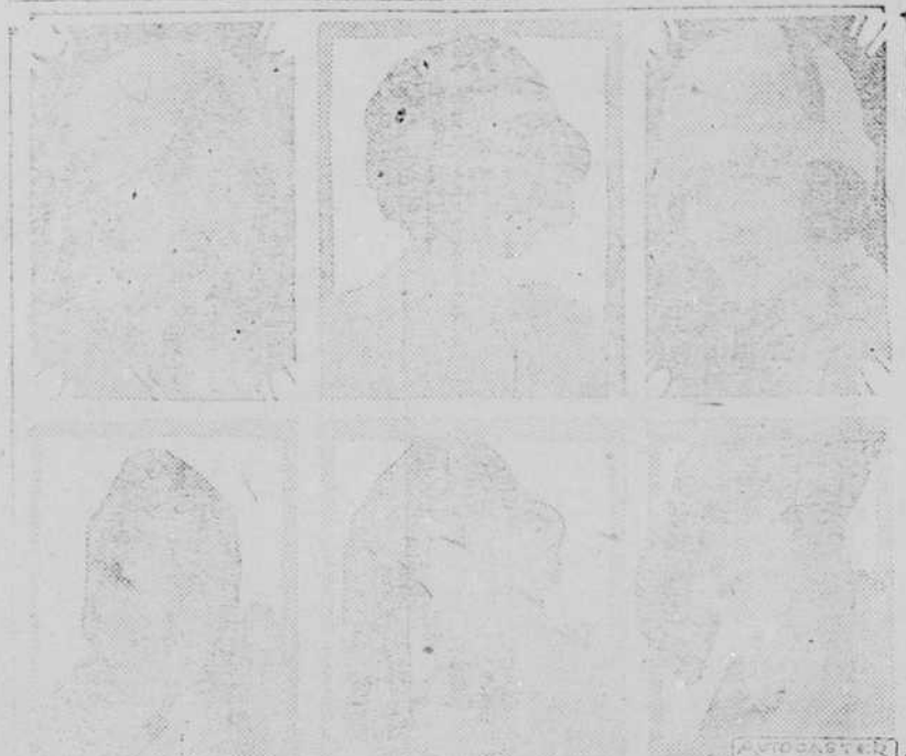
These three stunning American designed models, two of felt and the third of velvet and ribbon, follow the Paris designer's example, showing the attempt to bring back the picturesque motif.