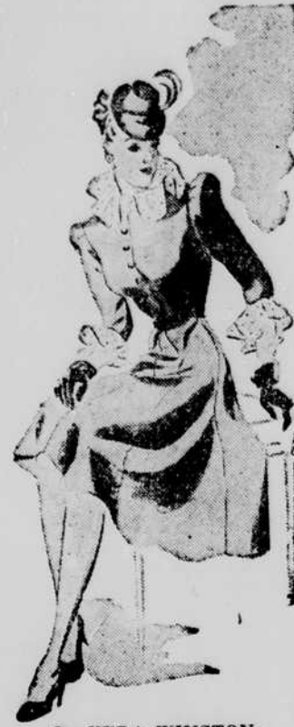
By VERA WINSTON

NO MATTER what the season, black is always high fashion. Here is a grand frock for general wear come spring. It is silk crepe with detachable collar and cuffs of white mousseline de soie, which has a tiny painted black pin dot. The snug bodice buttons to the waist and terminates in two pointed ends below the belt, which is of black leather. The skirt is molded at the hipline, and flares gracefully from there. It has eight gores.