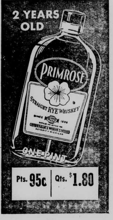
2 YEARS OLD ONE PINT Pts. 95c | Qts. $1.80

Being a subdivided portion of Registered Estate No. 125, Book 6, page 175, of Washington County records, being the Northwestern section of lot No. 56 of a subdivision of certain