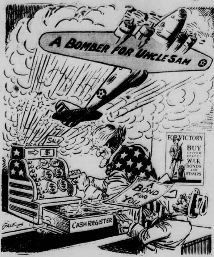
U. S. Treasury Department.