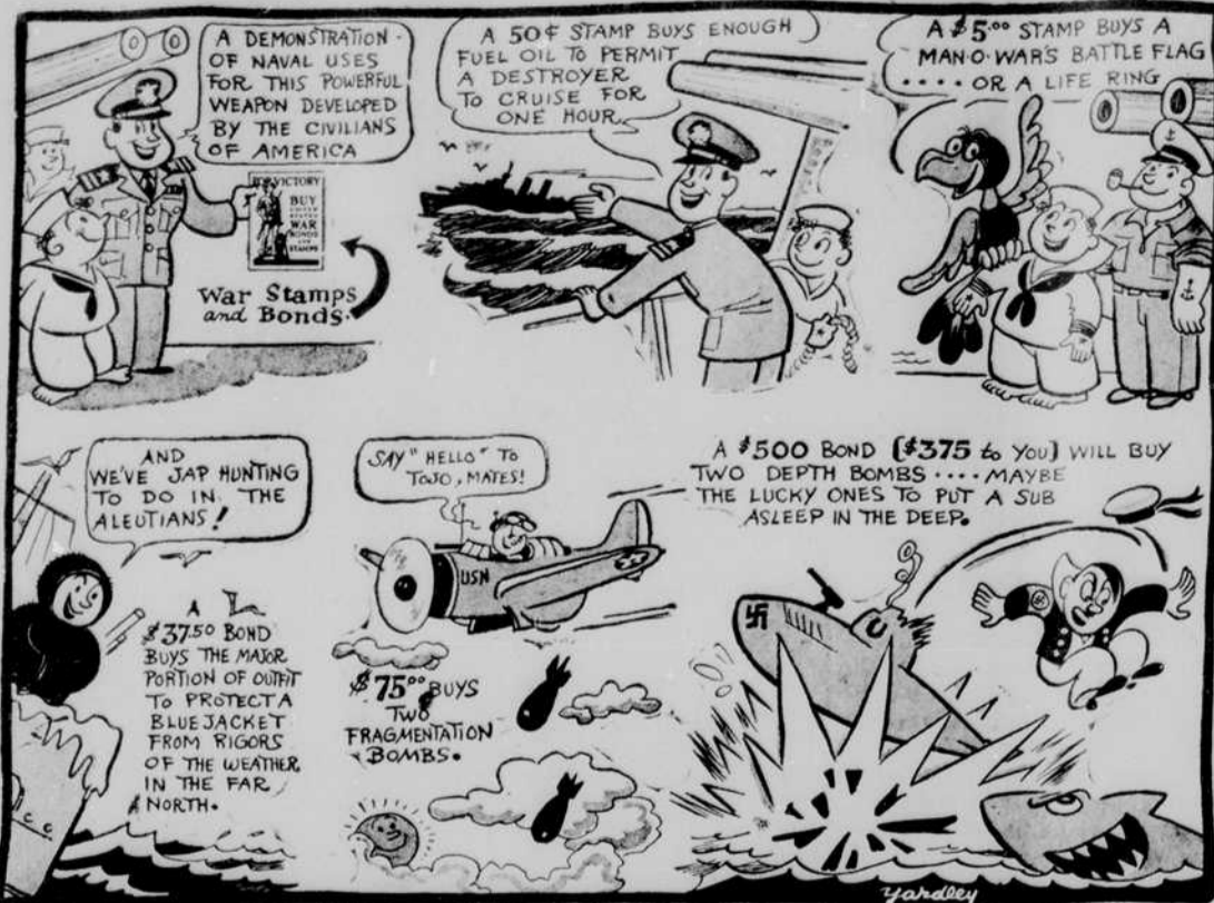
U. S. Treasury Department.