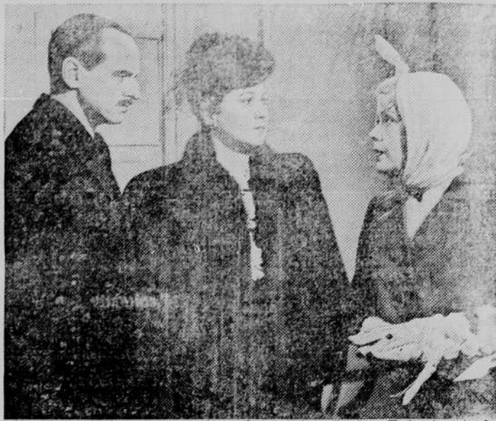
Fay Bainter is angered when she catches Spring Byington training for Red Cross work in this scene from "The War Against Mrs. Hadley," which will show at the Plymouth Theatre Christmas Day, next Friday. Fay Bainter, in the title role, portrays a woman who refuses to let the war interfere with her "living-as-usual."