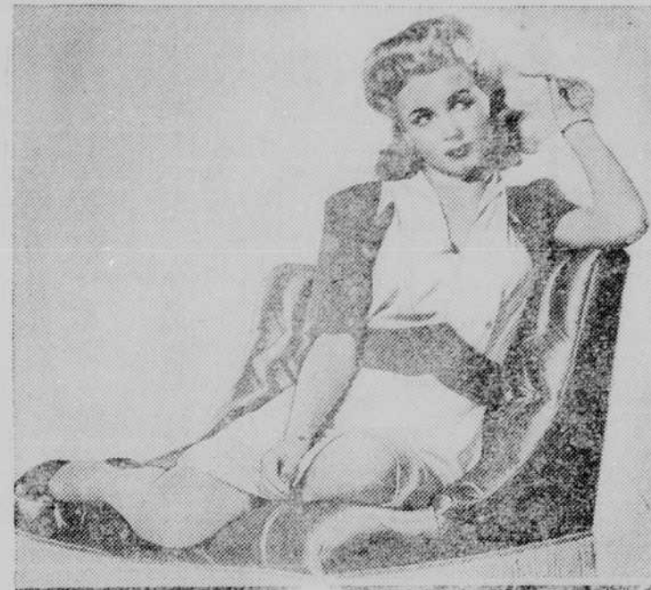
Janet Blair, above, is starred with Rosalind Russell and Brian Aherne in Columbia's hectic "My Sister Eileen," coming to the Plymouth Theatre Monday and Tuesday of next week. Alexander Hall directed the comedy, which is based upon the sensational Broadway stage success.