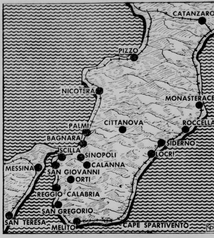
VETERANS OF THE British Eighth Army have landed on the Italian mainland to start the fight to knock Italy out of the war. After crossing the Strait of Messina from Sicily, the Allied troops succeeded in establishing beachheads from Reggio Calabria to San Giovanni.

with 201912 quarts; Swain Club is Beech Grove Club 999 quarts; Roper third with 1818 quarts; Alba Club club 8001/2 quarts; Busy Bee Club The canning report for the year is has canned 1652 quarts; Cherry 753 quarts; County Bridge Club ory is composed of the director, an not complete but figures thus for Club 1284 quarts; Scuppernong club 638 quarts; Creswell Club 6281/2 The State Department of Agricul- assistant agronomist, two soil chem- show what has been canned as fol- 1258 quarts; Cross Road Club 1258 quarts; Hoke Club 4211/2 quarts;