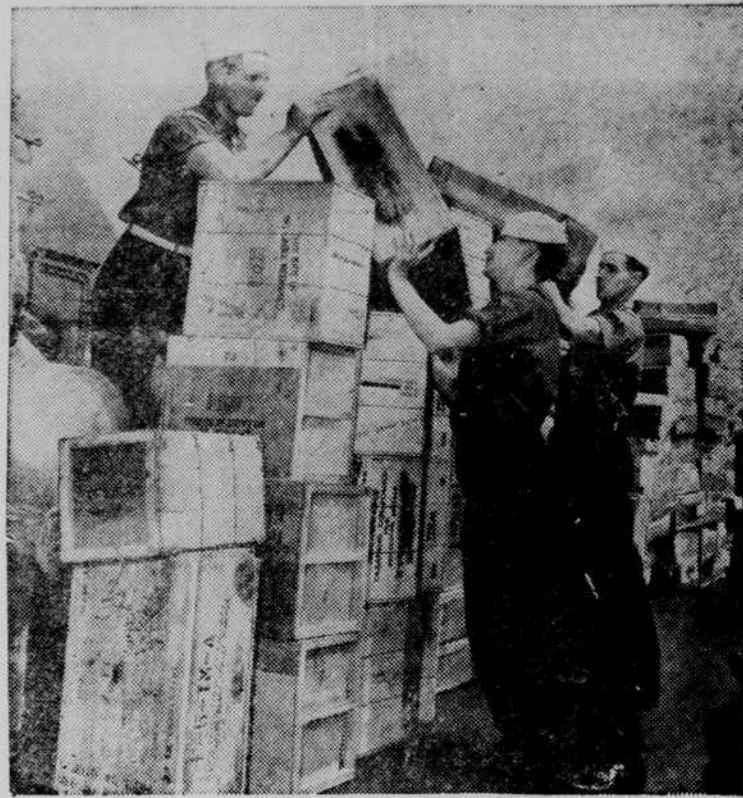
PACKED IN WOOD