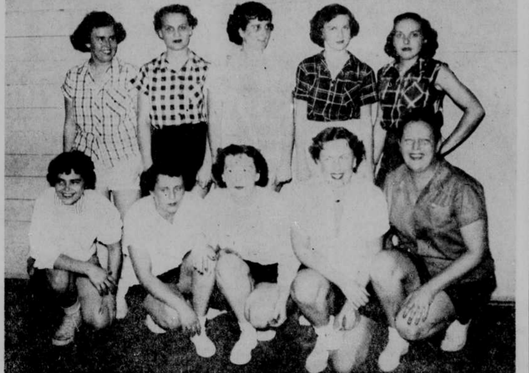
Pictured above are former basketball players who made up the all-star team which played Plymouth High School girls in the first game of a double-header at the gym here last Friday night.