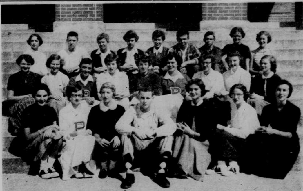
The Plymouth High chapter of the National Honor Society for the current school year numbers 25 members, pictured above on the steps at the high school building here.