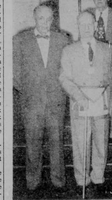
New officers of Perseverance Lodge, No. 59, A. F. & A. M., are pictured above following their installation here Tuesday night of last week.