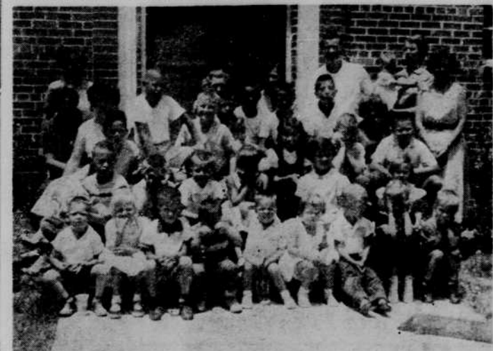
Faculty and student body of the Presbyterian Bible School are shown in front of the church following a picnic Friday, last day of the school. Total enrollment was 35 and average daily attendance was 30. A brief graduation service was held during the Sunday School hour at the church Sunday.