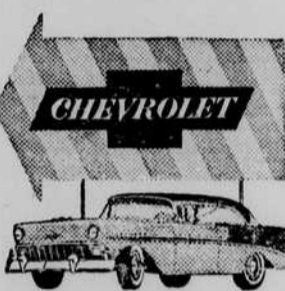
America's largest selling car—2 million more owners than any other make.

Chevrolet's astonishing roadability is a big reason why it's America's short track stock car racing champion. It can and does out-run and out-handle cars with 100 more horsepower. When you wed rock-solid stability to superb engines such as the 225-h.p. V8 that flashed the Corvette to a new American sports car record—then you get a real championship combination. Stop by for a sample!