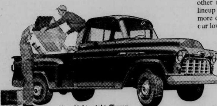
New Lightweight Champ

They bring you today's most advanced features for fast-working peak efficiency on any kind of job! They've got the most modern short-stroke V8 engines—packing more power per pound than any competitive truck V8. (Standard in many middleweights and all heavies; optional at extra cost in other models.) They've got the industry's greatest lineup of transmissions! They're fully loaded with more of the things you want! Whatever you do, get our low price before you buy!