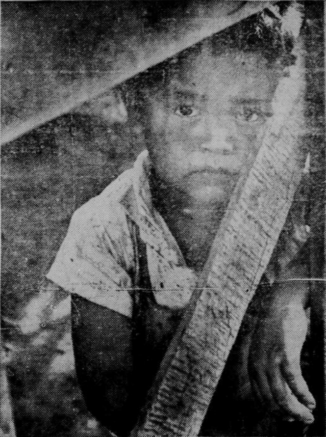
HOMELESS BOYS IN RIO DE JANEIRO, BRAZIL , number some 80,000. The 1956 Youth Offering will provide buildings for a boys town near Rio, where they can grow in a wholesome and loving Christian environment. This photo is part of the "Family of Man" photography exhibit, now touring the United States.

During the week ended June 16 there were 1,704,000 chicks placed with broiler growers in North Carolina.