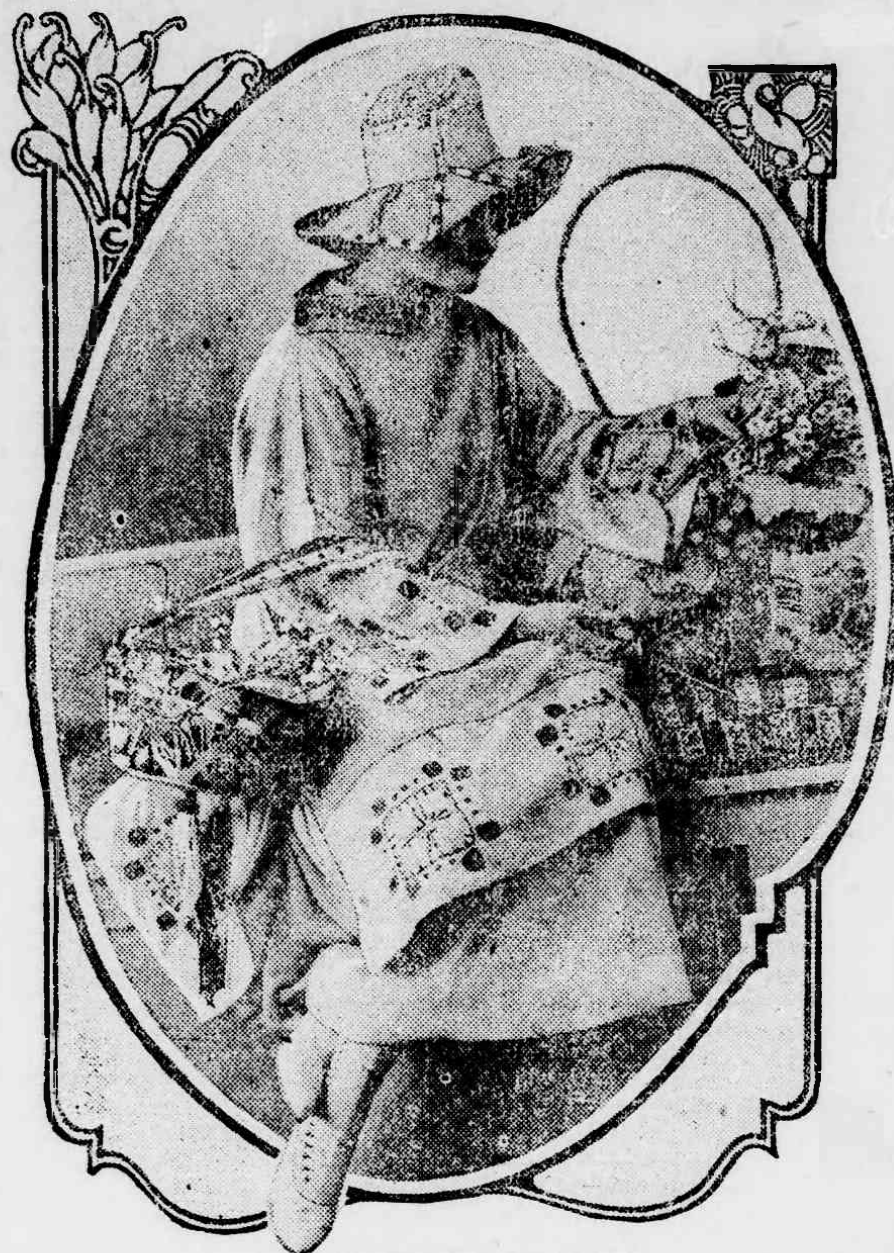
THE GARDENER AT REST.

PICTURESQUENESS can go no further than this Chinese garment of canary yellow linen, hand embroidered in squares of golden brown and jade green. A square linen hat takes the same design, and oriental tassels adorn the bandbox of a garden basket.